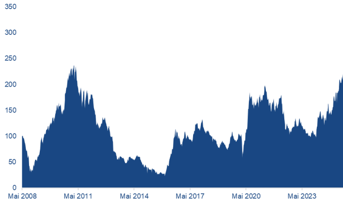
Gold 3000 in CHF 02.05.2008 - 26.11.2025